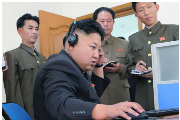
This image shows Kim Jong-Un contacting a machine plant to give them field guidance using a computer.

Kim Jong-Un's restrictions are extremely tight. Only 9.7% of north Koreans own a cell phone (excluding smuggled phones from other countries.) Very few high ranking government officials have access to the worldwide internet, while some schools have access to a intranet, a private/local network called Kwangmyong, that is closely watched and censored by the north Korean government. After his uncle, Jang Song Thaek, was executed for wanting reform, Kim Jong-Un had Jang's name taken out of the media through post-editing of newsreels yet another way Kim controlled the media within north Korea.