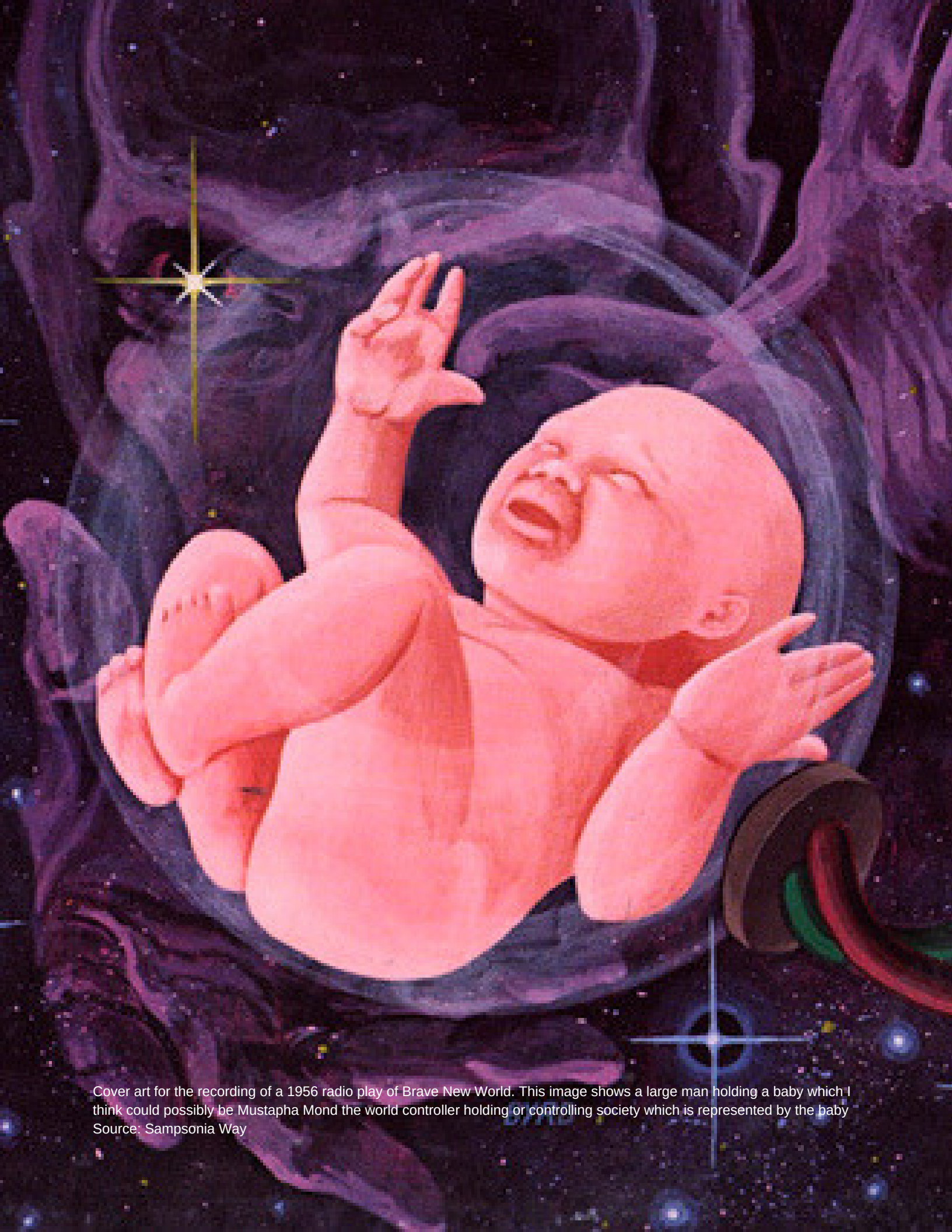
Cover art for the recording of a 1956 radio play of Brave New World. This image shows a large man holding a baby which I think could possibly be Mustapha Mond the world controller holding or controlling society which is represented by the baby