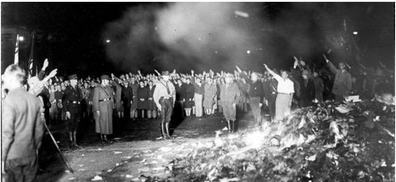
This image shows a Nazi book burning On May 10, 1933, with university students at Opera Square in Berlin.

Even though Hitler's more public displays of media destruction were different than the internet access restraint in North Korea or the retouching of photos in the USSR, it still aimed to do the same thing, change or control the citizens' minds through what they can access and keep those people thinking like the government wants them to.